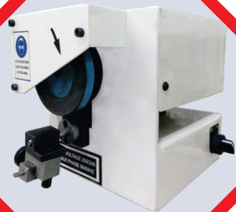
Carbide tool lapping device